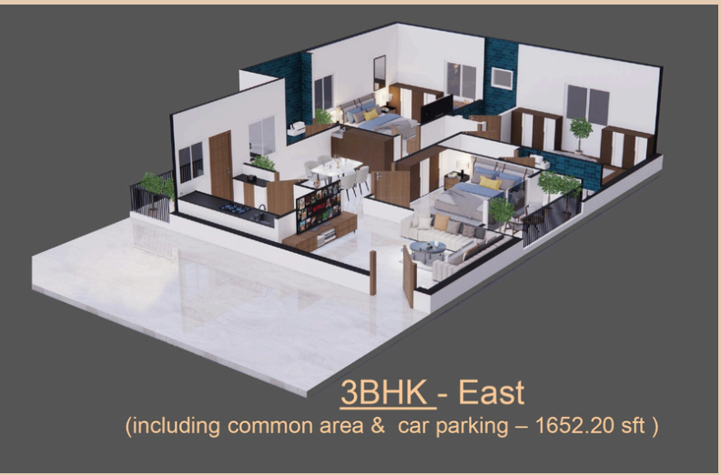
3BHK - East (including common area & car parking – 1652.20 sft )