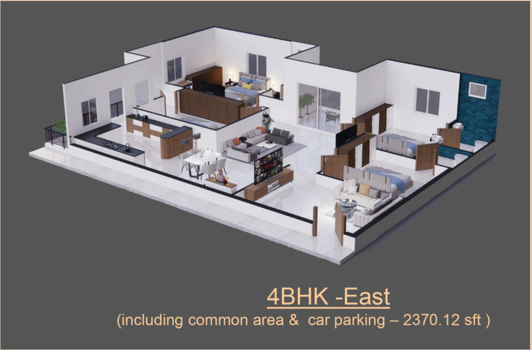
4BHK - East (including common area & car parking – 2370.12 sft )