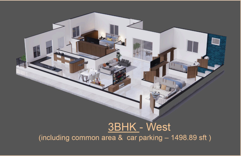
3BHK - West (including common area & car parking – 1498.89 sft )