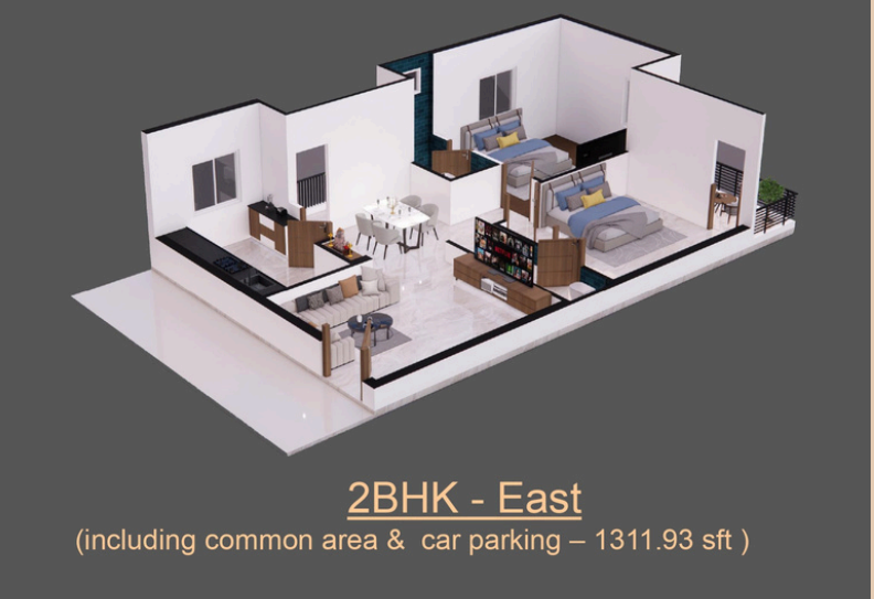
2BHK - East (including common area & car parking – 1311.93 sft )