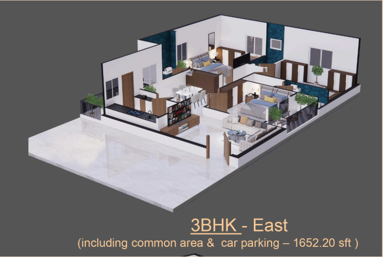
3BHK - East (including common area & car parking – 1652.20 sft )