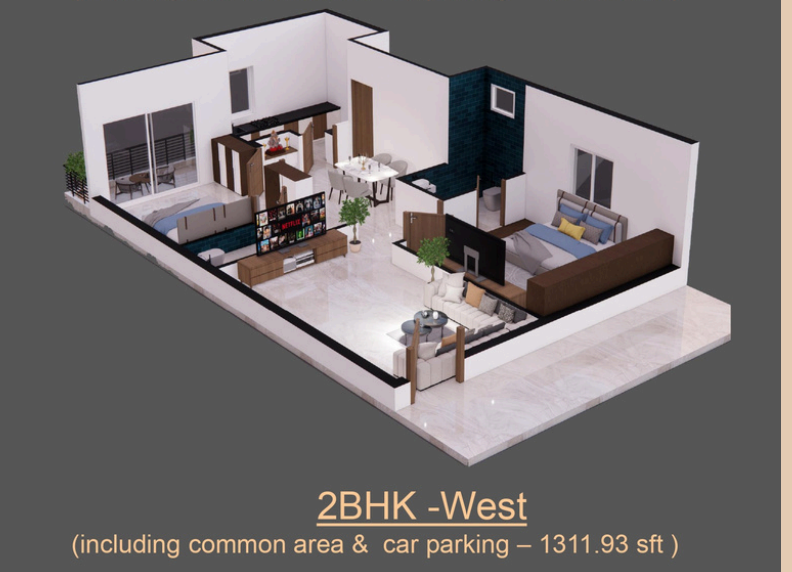
2BHK - West (including common area & car parking – 1311.93 sft )