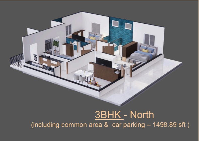
3BHK - North (including common area & car parking – 1498.89 sft )